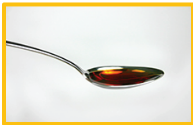
AlaskOmega® Wild Red Pollock Oil